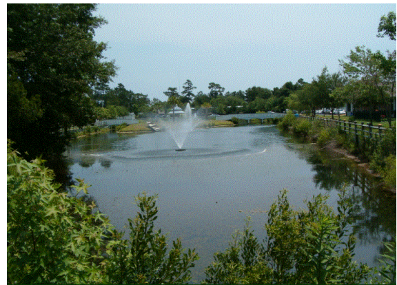
Figures 1 and 2: Stormwater ponds used for irrigation in Myrtle Beach, and recreation/aesthetics in Charleston, SC.

The research summarized in this report found that some ponds protect receiving waters from pollution and protect communities from flooding during storms, while other studies found that ponds were polluted, can impact receiving waters, and are not controlling stormwater runoff as they were designed and permitted. Because stormwater ponds have diverse designs and characteristics, determining a common denominator for pond performance is difficult. These structural designs (Appendix A) and other factors such as age, location within the watershed, and linkages with other ponds play an important, albeit not well understood, role in their functioning and performance. A variety of research on stormwater ponds addresses their functionality, water and sediment quality, and surface and groundwater impacts. If not properly maintained, ponds can accumulate sediment and debris and have slope and/or outlet failures, resulting in high sediment and pollutant loadings to receiving waters. When sediment is removed from ponds as part of routine maintenance, contaminated sediments could require disposal at certified landfills.